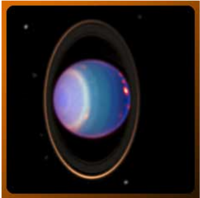
Uranus from Hubble