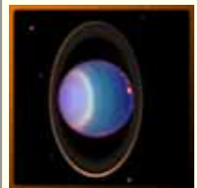
Click here to learn more about the tilt of Uranus.