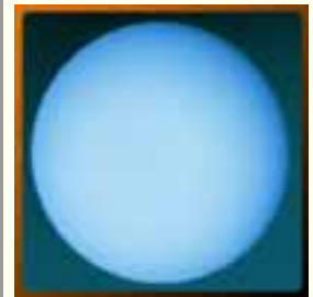
A picture of Uranus taken by the Voyager 2 spacecraft.